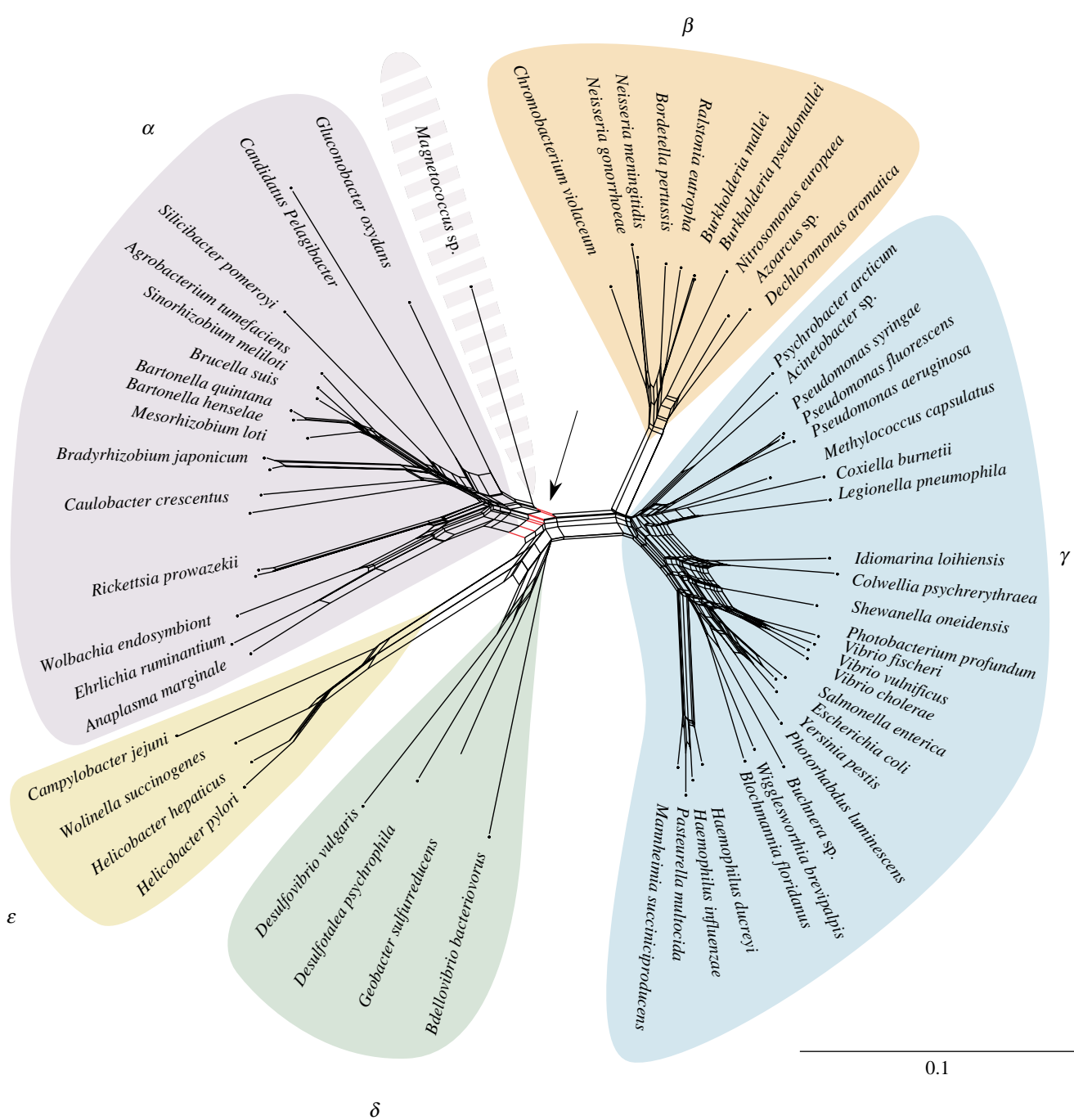
Figure 2. Neighbour-Net (Huson & Bryant 2006) of proteobacterial 16S rRNA. The bootstrap support for the split of Magnetococcus with \alpha -proteobacteria (highlighted in red and with arrow) is 73% using neighbour-joining, 61% using Neighbour-Net and 45% using maximum likelihood (see electronic supplementary material).